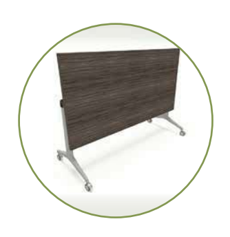
Flip Down For Storage