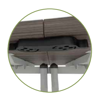
Ganging Brackets Allow Tables Lock Together Seamlessly