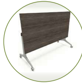
Flip Down For Storage