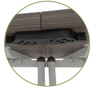
Ganging Brackets Allow Tables Lock Together Seamlessly