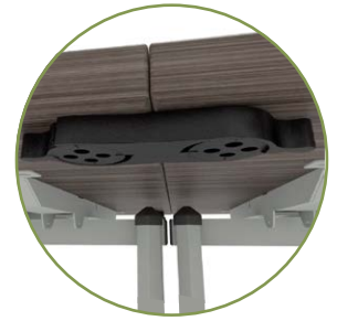
Ganging Brackets Allow Tables Lock Together Seamlessly