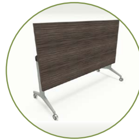
Flip Down For Storage